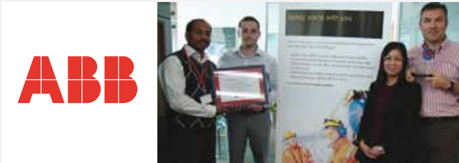
ABB won the 'Best CSR Initiative of the Year' award at Middle East Electricity exhibition for its IMA Health and Safety Week held in April, 2011. The company was also nominated as one of the top four companies in the region in 'HSE Project Initiative of the Year' category. The awards ceremony took place in Dubai Trade Center in the UAE. Companies from all over the Middle East competed in six categories for the Middle East Award.

ABB has also invested in upgrading the lighting system of the signage at the ABB facility in Al Quoz Industrial zone in Dubai. The operations included the replacement of five ABB logos, four of which were illuminated using state-of-the-art light emitting diode (LED) technology. Not only will the project allow for more than 13,000 AED per year savings on the electricity bills, it will also prevent the emissions of more than 11 tons of CO2 per year roughly.